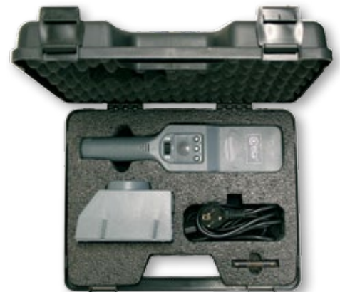
V140 CARRYING CASE

THE SPECIAL ERGONOMIC SHAPE OF THE DEVICE ALLOWS INSPECTION WITHOUT THE INTERFERENCE OF THE OPERATOR'S FINGERS